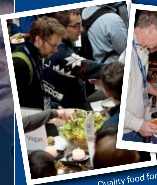
Quality food for everybody