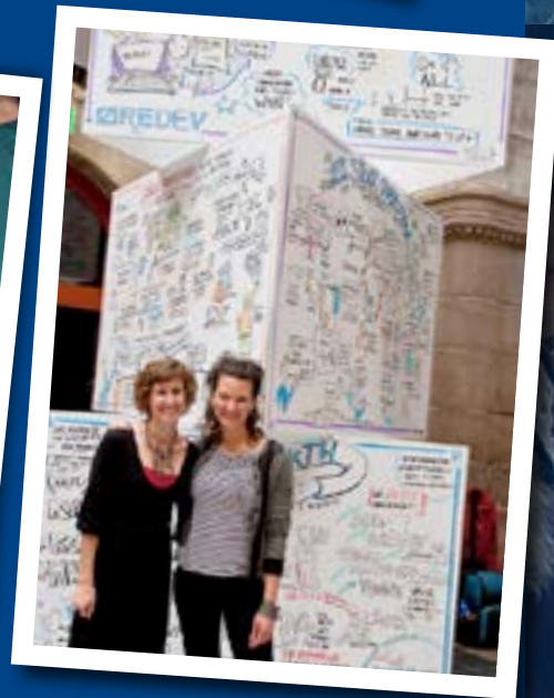
Things are always happening on the exhibition floor