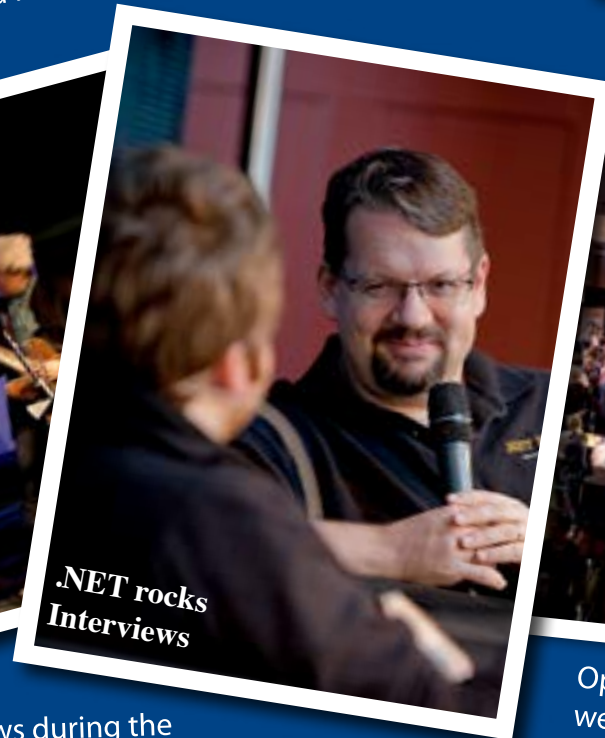
Stage with interviews during the day and jazz music in the evenings