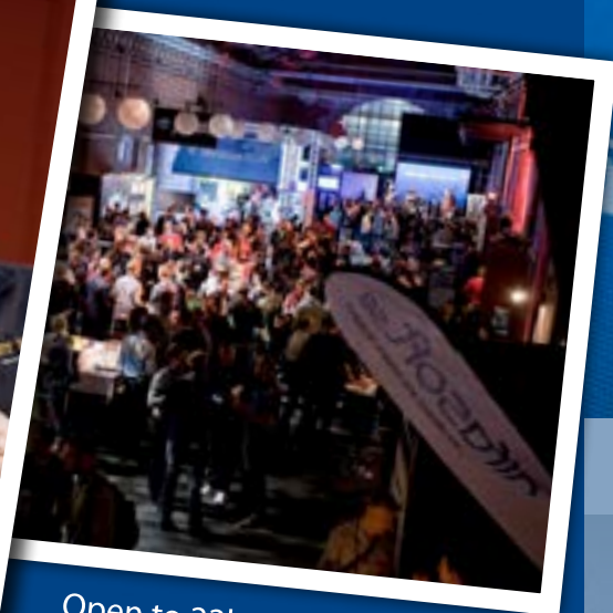
Open to 22h30 on wednesday and thursday